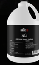
HDF High Density Fog Fluid