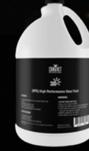
HFG High Performance Haze Fluid