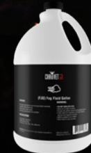
FJU High Performance Fog Fluid